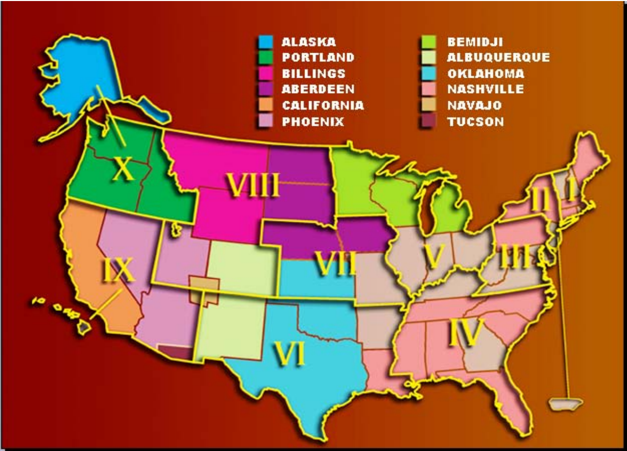
Figure: U.S. Department of Health and Human Services Regional Divisions and Indian Health Service Areas