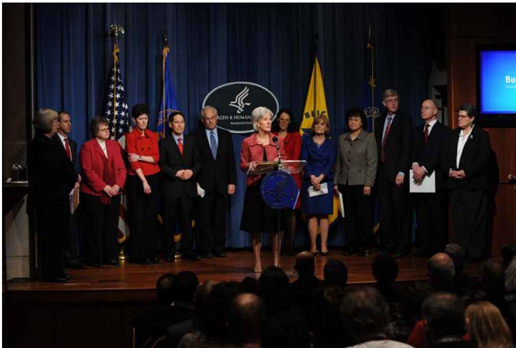
United States Department of Health and Human Services, HHS Division Directors